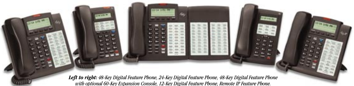
Left to right: 48-Key Digital Feature Phone, 24-Key Digital Feature Phone, 48-Key Digital Feature Phone with optional 60-Key Expansion Console, 12-Key Digital Feature Phone, Remote IP Feature Phone.

ESI's built-in automatic call distributor (ACD) — another standard X-Class feature — manages incoming departmental calls. You can easily program handling and distribution of calls (including those waiting in queue), and monitor how efficiently your inbound calls are being managed. Incidentally: ACD is for businesses of all sizes, because even just one extension can benefit from its advantages. If you're in business and you take phone calls, ACD will improve your communications with your customers and prospects.